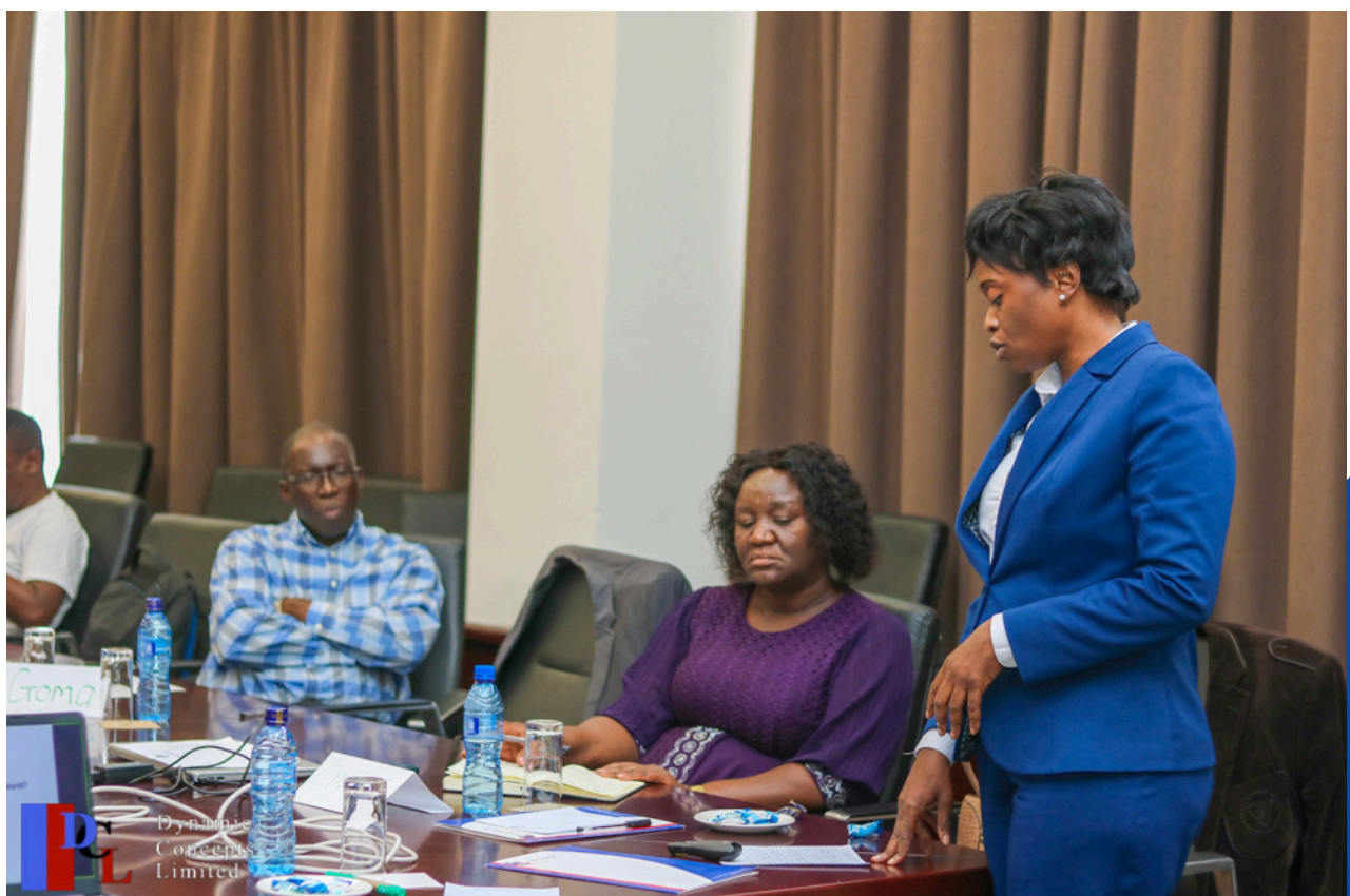
Picture highlight from the Change Management training session