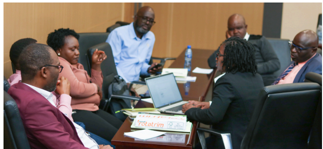
Management team during the training discussions