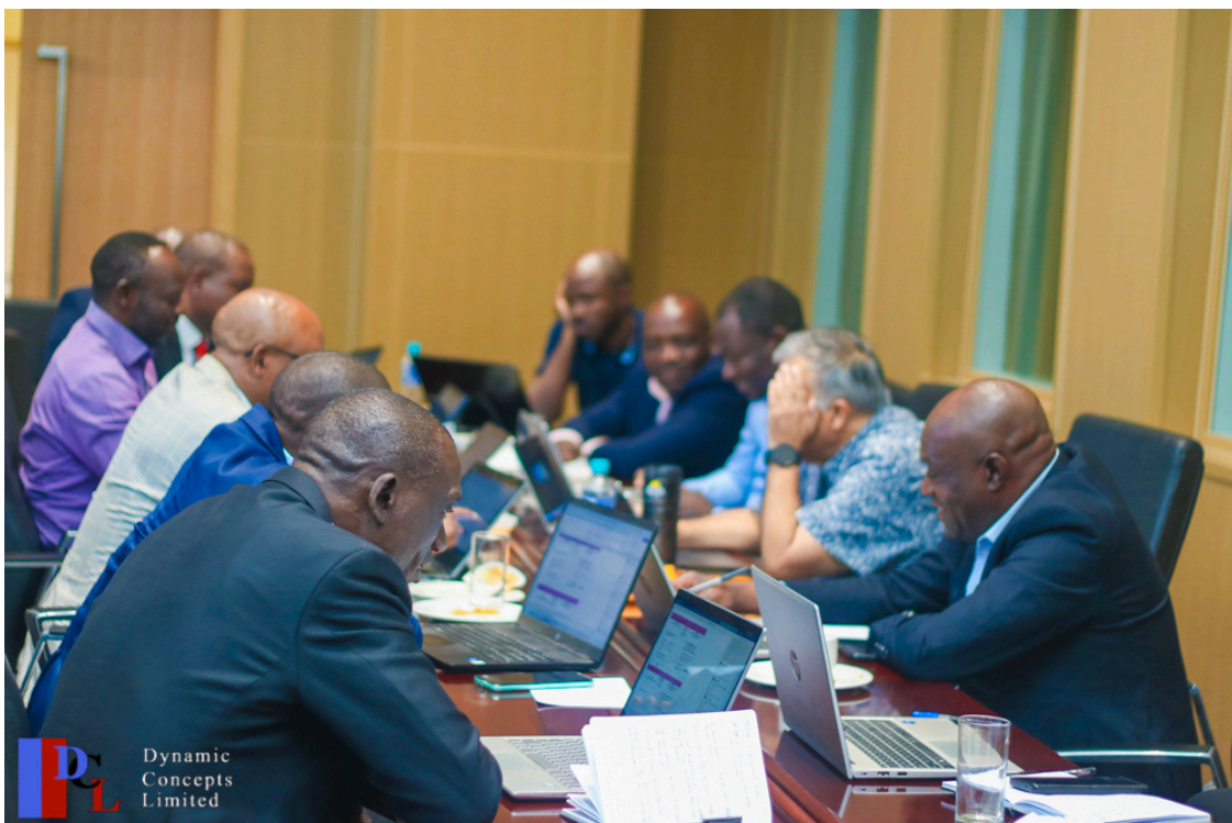
Zambia Railways Limited- Strategic Plan development workshop