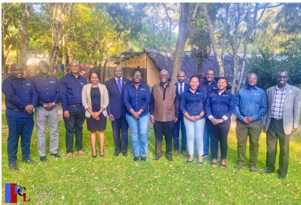
The Board and Management of Zambia Credit Guarantee Scheme (ZCGS).

The mandate of ZCGS is provision of partial credit guarantees to enable viable and eligible Zambian Micro, Small and Medium Enterprises (MSMEs) with inadequate collateral, have increased access to affordable financing from lending financial institutions thereby promoting their growth and development.